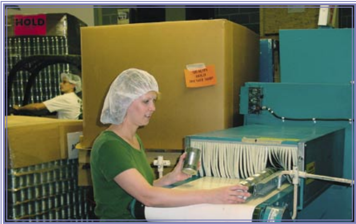
X-ray Inspection in Progress

This service provides alternatives and options for the disposition of products due to defects or contamination.