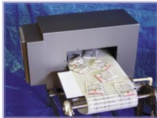
Digital Metal Detector